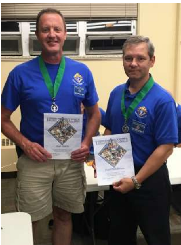
Basalla & Chwialkowski Families of the Month!